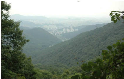
View of Mudeungsan Mountain