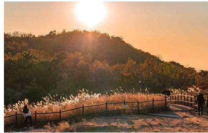
Mudeungsan Jungmeorjae Pass